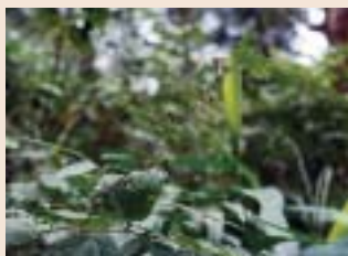
The arogyapaacha plant from which the Jeevani drug was developed and subsequently patented by the Indian research institute TBGRI.

In South India the medicinal knowledge of the Kani tribes led to the development of a sports drug named Jeevani, an anti-stress and anti-fatigue agent, based on the herbal medicinal plant arogyapaacha . Indian scientists at the Tropical Botanic Garden and Research Institute (TBGRI) used the tribal know-how to develop the drug. The knowledge was divulged by three tribal members, while the customary rights to the practice and transfer of certain traditional medicinal knowledge within the Kani tribes are held by tribal healers, known as Plathis . The scientists isolated 12 active compounds from arogyapaacha , developed the drug Jeevani, and