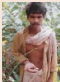
Kani tribal member identifies components of the arogyapaacha plant

filed two patent applications on the drug. The technology was then licensed to the Arya Vaidya Pharmacy, Ltd., an Indian pharmaceutical manufacturer pursuing the commercialization of Ayurvedic herbal formulations. A trust fund was established to share the benefits arising from the commercialization of the TK-based drug.