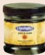
JEEVANI is a product of the Arya Vaidya Pharmacy which is an Indian company.