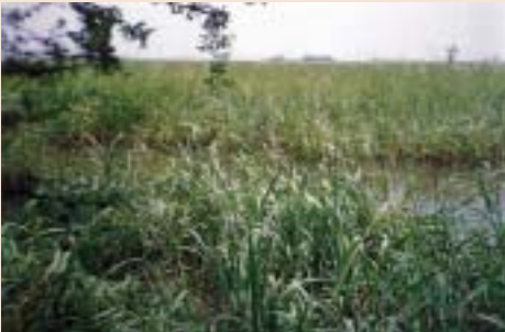
Oryza longistaminata grows in the marshes and river banks of Mali.

concerning conservation, sustainable use and equitable benefit-sharing of genetic resources. In general, the preservation and protection against loss and degradation of TK should work hand-in-hand with the protection of TK against misuse and misappropriation. So when TK is recorded or documented with a view to preserving it for future generations, care needs to be taken to ensure that this act of preservation doesn't inadvertently facilitate the misappropriation or illegitimate use of the knowledge.