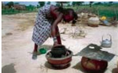
Preparation of Oryza longistaminata for food consumption, Mali

Customary laws, protocols and practices often define how traditional communities develop, hold and transmit TK. For example, certain sacred or secret TK may only be permitted to be disclosed to certain initiated individuals within an Indigenous community. Customary laws and practices may define custodial rights and obligations over TK, including obligations to guard it against misuse or improper disclosure; they may determine how TK is to be used, how benefits should be shared, and how disputes are to be settled, as well as many other aspects of the preservation, use and exercise of knowledge.