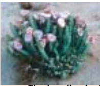
The hoodia plant

parties from misappropriating TK. Other legal tools are more effective against misuse of TCEs. Protection of TCEs/Folklore also touches directly on other policy areas, such as cultural and artistic policy. It is a policy and legal domain that is in practice distinct from, but related to, protection of TK. A separate booklet ( “Intellectual Property and Traditional Cultural Expressions/Folklore” , WIPO Publication No. 913 E) therefore deals with the complementary protection of TCEs, and this booklet focuses on the protection of TK as such – that is to say, the content or substance of knowledge. This reflects the diversity of choices made in many countries: frequently TK and TCEs are protected through distinct legal mechanisms; in some cases, the two aspects are protected under the one comprehensive law.