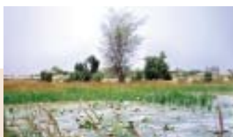
Oryza longistaminata growing near a Bela Community village

Traditional healers of Samoa were recently acknowledged in a benefit-sharing agreement concerning the development of prostratin, an anti-AIDS compound derived from the Samoan native mamala tree ( homalanthus nutans ). Prostratin forces the HIV out of reservoirs in the body, thus allowing anti-retroviral drugs to attack it. The bark of the mamala has been used by traditional healers to treat hepatitis, among other medicinal uses of the tree. This traditional knowledge guided researchers in their search for valuable therapeutic compounds. Reportedly, revenues from the development of prostratin will be shared with the village where the compound was found and with the families of the healers who helped discover it. Revenues will also be applied to further HIV/AIDS research. It is also proposed to license the prostratin research to drug makers so that the resultant drugs are made available to developing countries for free, at cost, or at a nominal profit.